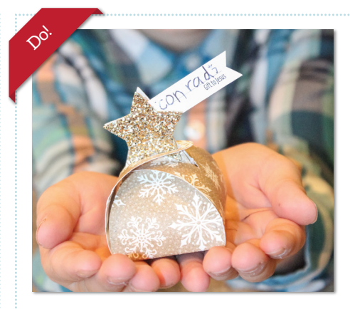
Create origami gift boxes with notes hidden inside.

Talk as a family about the gifts we can give Jesus.